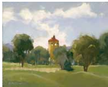
Atrium Don Biehn